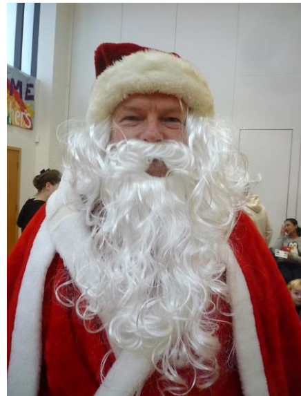
This year's Santa was a volunteer from the Academy! He enjoyed it so much he has volunteered for next year!