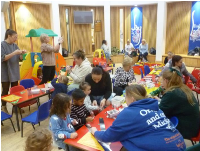
Busy with craft at the Christmas Party

We've had another very busy year! On average we've had 75 people attending each week. Although our attendance can vary considerably with the weather; a very snowy morning on the 10 th March saw just one mother and child! Our highest attendance was for the Christmas Party with 34 children and 29 adults. That's a lot of presents for Santa to distribute!