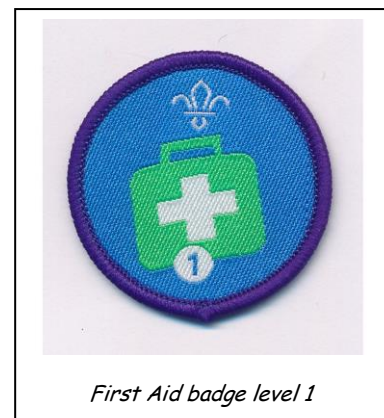
First Aid badge level 1

Many thanks to the Church for your support, donations and help. Please remember us in prayer often, particularly regarding our relationships with the new children and their parents and for the leadership's sustained enthusiasm and encouragement.