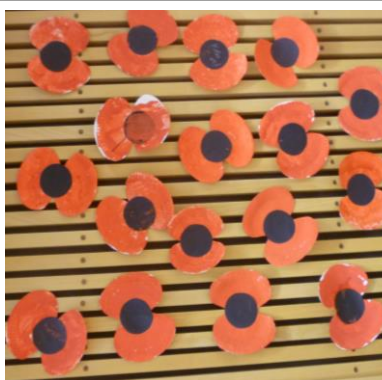
Poppies for Remembrance Day

Our one charity event of the year is in November for Children in Need when we hold a Teddy Bears' Picnic. This year we raised £70.