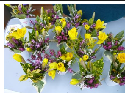
Posies for Mothering Sunday