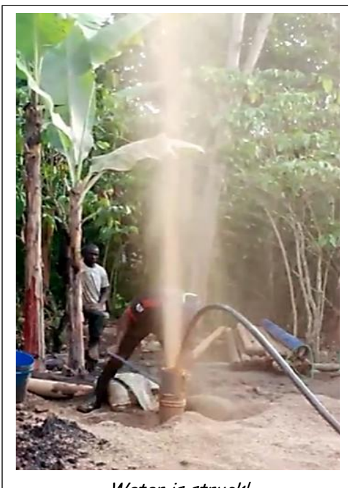
Water is struck!

The people of Kashenye say 'Tasing muno' - thank you very much!