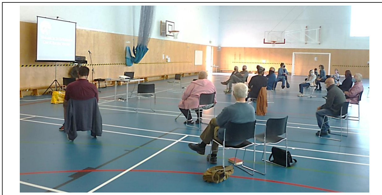
Since 6<sup>th</sup> September our 'live' services have been held in the Academy's Sports Hall

Not long after writing the report last year the Country was hit by a national Pandemic which is still very much in evidence as we write this report. Due to Government restrictions to save lives and protect the NHS the City and Country have been in lockdowns to stem the rate of infections. When the first lockdown was started in March 2020 the use of church buildings for worship was not allowed and therefore home worship took the order of the day. When restrictions were gradually eased during the summer the church was assessed if it could be used for worship under the government guidelines. However, the requirements of a 2 metre rule between people meant that it would have been difficult seating everybody within our space. An arrangement was then agreed with the School whereas worship on a Sunday morning was carried out in the Sports Hall and the church was used by the School during the week as an area for staff to relax in.