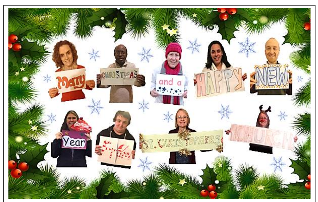
The Christmas card delivered to fringe members with a small gift