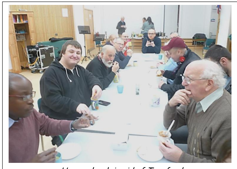
Hunger lunch in aid of Tearfund

Two of the young people, who grew up in our church, continue working in sensitive areas and are supported by Arab World Ministries and Cross Links . Both have found that their work has been limited to mainly working on-line because of the pandemic.